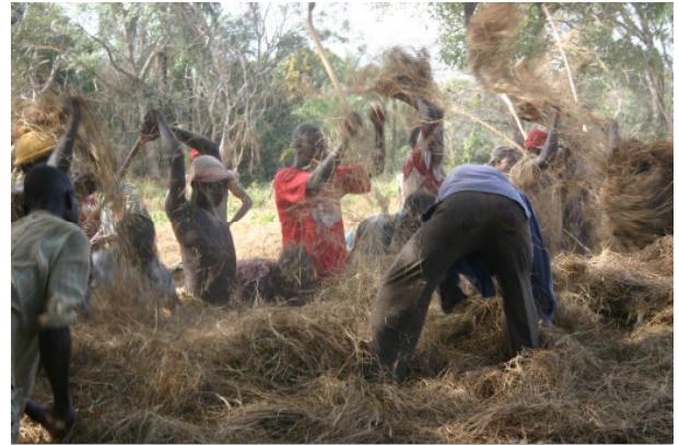
The fonio threshing machine

The music of the balaphon* led us to the work-site from over a mile away. As we approached, we saw a line of 15 young men flaying a huge pile of dried grasses with long, thin sticks. They were beating the fonio in time to the music and in competition with each other, dripping with sweat and covered with straw and fonio seeds. During regular intervals different people from the crowd would approach the musicians, stopping the music to give a speech of praise for someone or to jokingly insult a fellow beater in order to heighten the competition. Then the speech maker tossed a coin to the musicians and the beating competition continued in time with the song request. Work and play, dance and song mingled together to accomplish the task at hand.