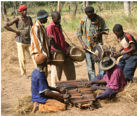
The griots play an integral role during the harvest.

On the other hand, using a threshing machine would destroy working in community as people would no longer need each other. In a traditional fonio beating everyone plays a role. The young men cut and beat the fonio, the old men turn the pile of fonio and haul away the beaten stalks; the women cook a huge meal for everyone and then, after the meal, they cheer the beaters to work harder. Even the children have their role, playing in the straw and watching how a fonio harvest works in anticipation of the day when they are old enough to actively take part.